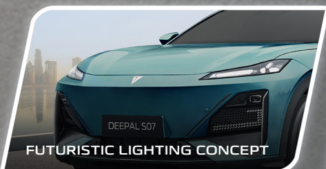
FUTURISTIC LIGHTING CONCEPT

Rise above the ordinary. Born to outstand, the DEEPAL S07 is a fearless e-SUV, built to push beyond limits.